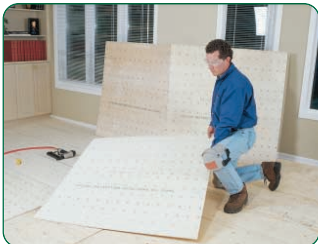
Lay-up and fasten one panel at a time.