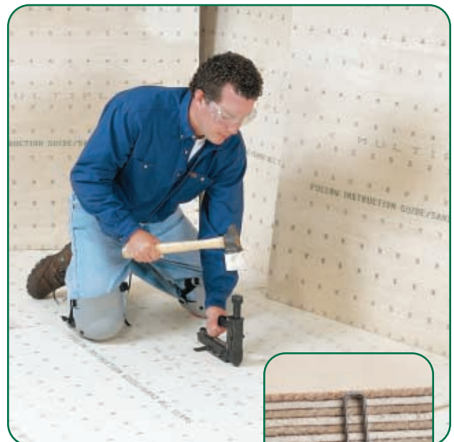
Recess fastener heads 1/16" and assure 75% to 90% penetration into the subfloor.