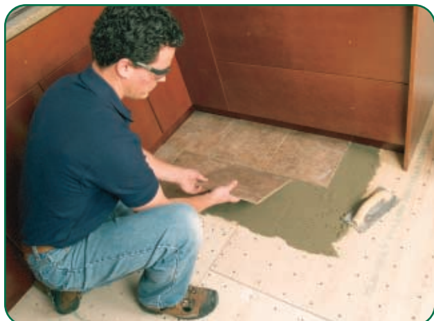
Trowel mortar directly onto Multiply underlayment.