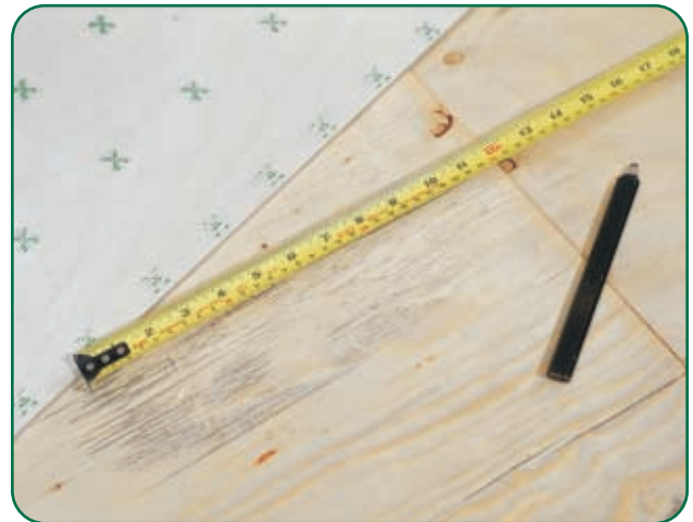
Stagger Multiply Underlayment seam a minimum 12" over the subfloor seam.